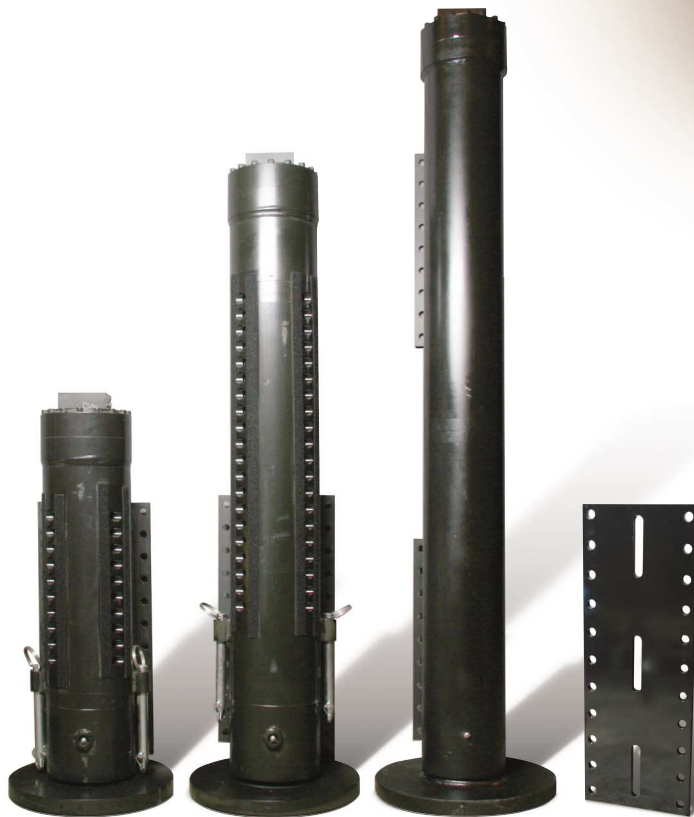
Matching mounting plates available upon request