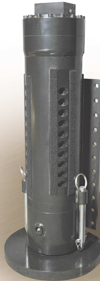
6" Bore, 70,000# capacity leg